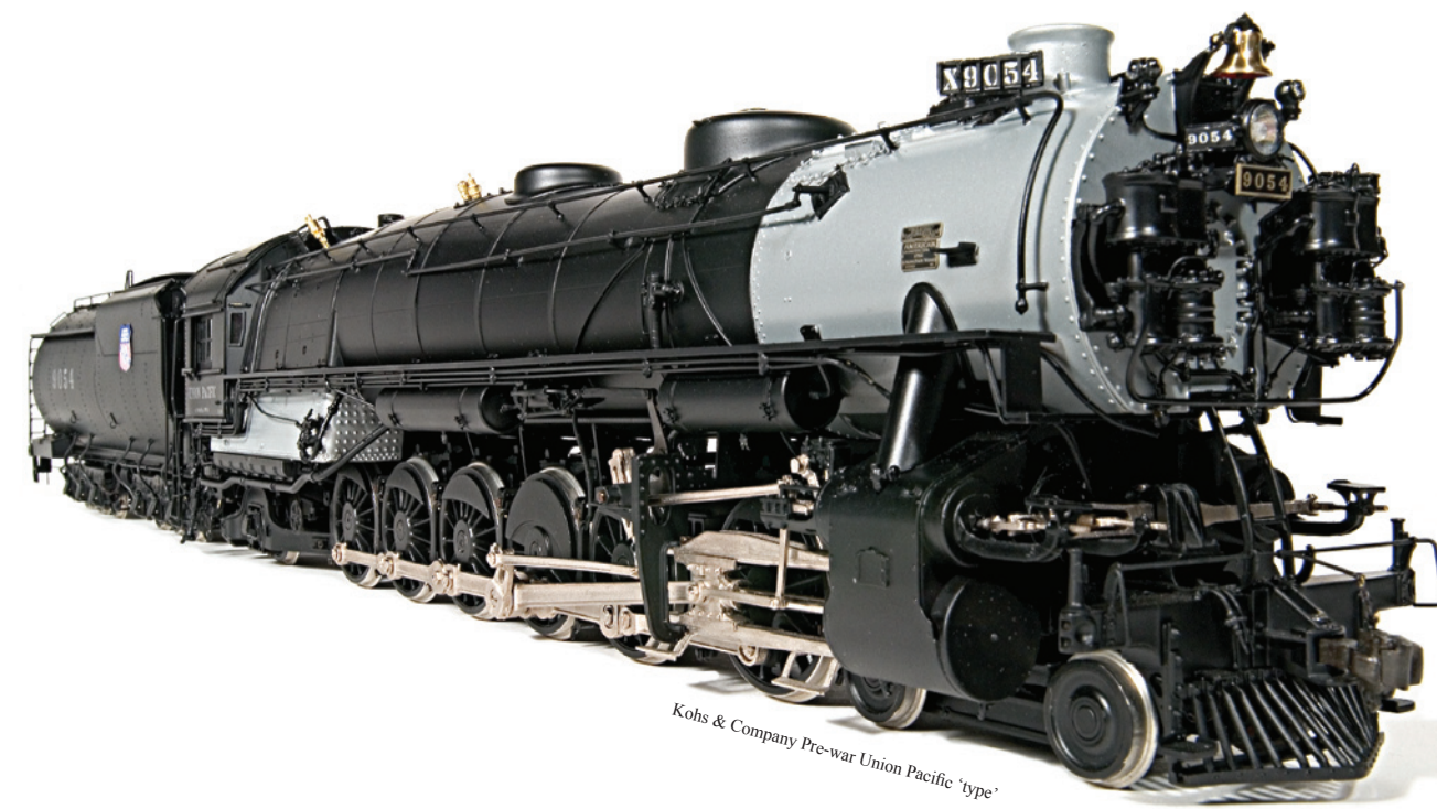
Kohs & Company Pre-war Union Pacific 'type'

If we meet at one of our scheduled shows we will have a great deal to discuss as we have been busy. In addition to the projects that we currently have running, the 'Pennsy' K-4 and N5c cabin cars, we have been preparing for the launch of our next locomotive project which is the Allegheny class locomotives. With each new project we strive to raise the bar and include features that make the models we offer as unique as possible. We put a great deal of effort into our photos and promotional material, but we routinely hear that the photos do not do the models justice, please come out and see for yourself!